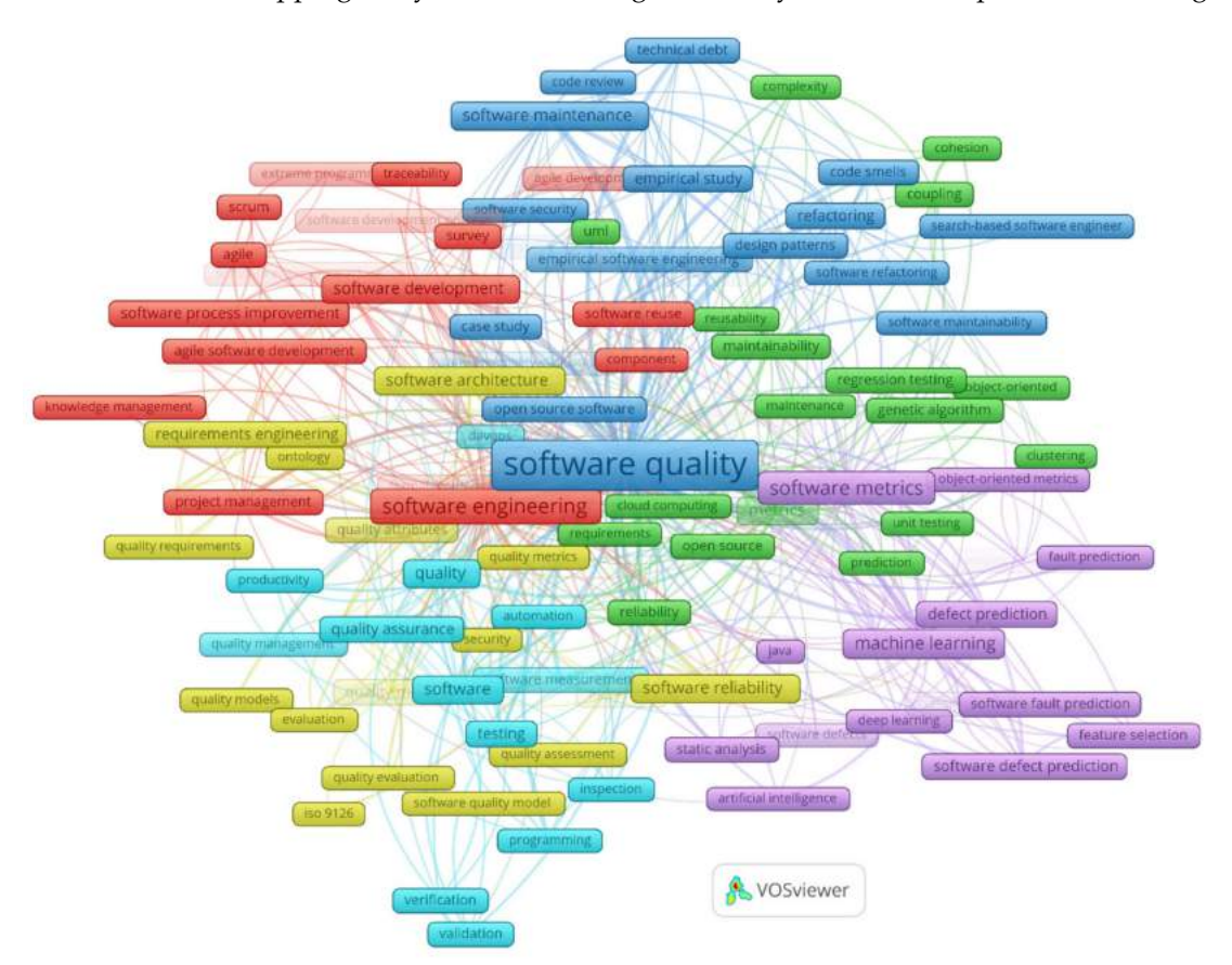
Figure 2. Authors' keywords cluster landscape.

The 15,468 publications from the corpus were analysed using VOSviewer software (Step 2 of the algorithm). Text mining identified 19,084 author keywords. All keywords emerging in at least 40 papers (116 authors' keywords) were included in the bibliometric mapping analysis. The resulting author keywords landscape is shown in Figure 2.